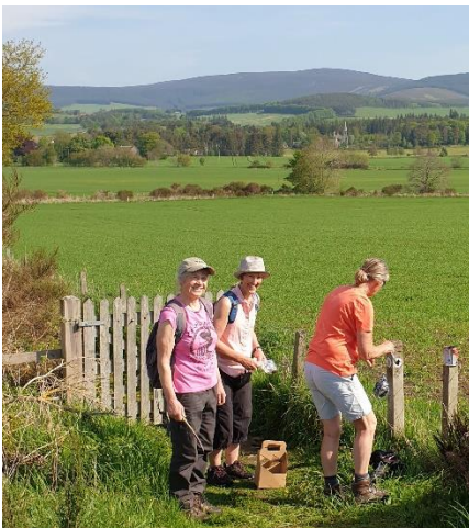
Paths Group - Tuesday Tramps maintaining the waymarking signs