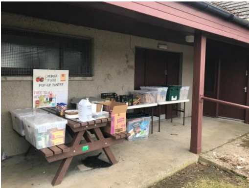
Cromar Food Waste Project - Pop up Pantry at the Pavilion, Tarland