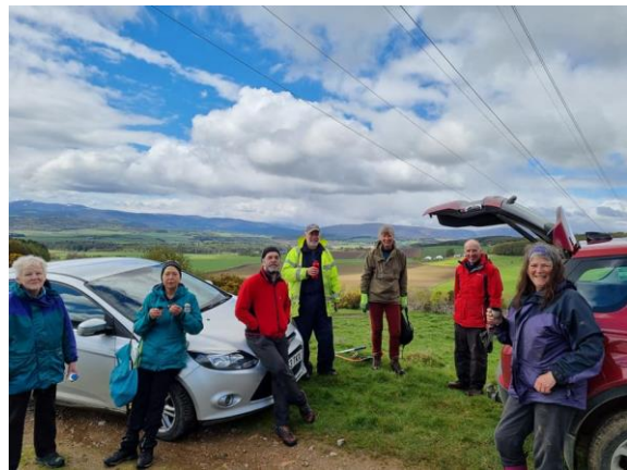
Paths Group - Saturday morning monthly maintenance group at Jubilee Woods