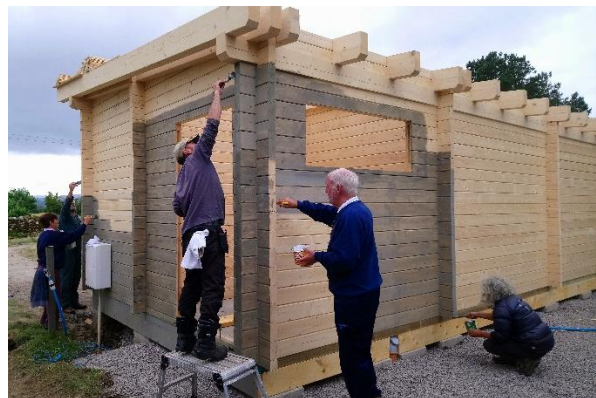
Tarland Bee Group - Finally it's up and the members start painting the Educational Facility at Oldtown Walled Garden