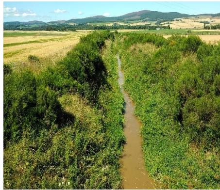
Wetlands Project - A straightened section of the Tarland Burn